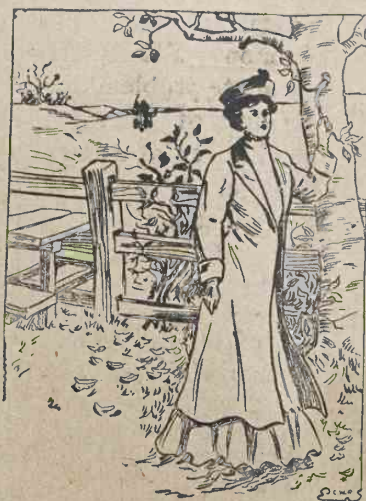
She Stood Under a Beech Tree.

Miss Carew filled page after page with rapid characters. When he had definitely ceased she sighed, dropping her pencil. If she had yielded to impulse, she would have buried her head on her arms and so remained under the spell that had magnetized her. Too tactful in the presence of this uncontrolled and personal man to betray anything of herself or her